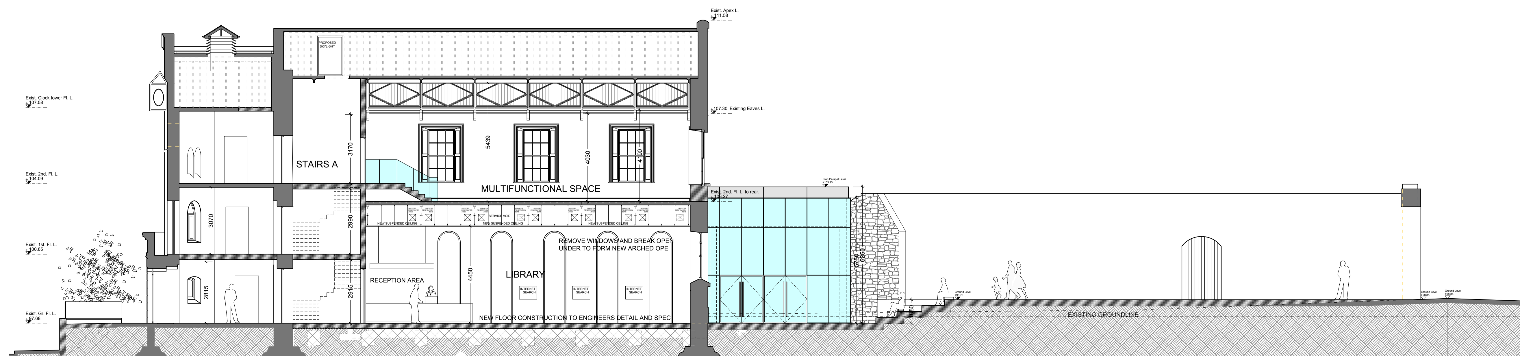
4 PROPOSED SECTION B-B SCALE 1:100

NOTES This drawing has been prepared for the following purpose only: PART 8 It should not be used, nor information contained therein be relied upon, for any other purpose whatsoever. All drawings to be read in conjunction with all other related documents and other consultants drawings and documentation. Architects to be informed immediately of any discrepancies before work proceeds.